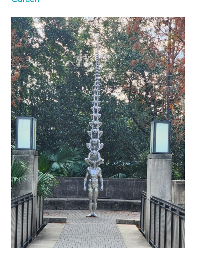
Above and at left, several of the exquisite items to be found throughout the Sculpture Garden