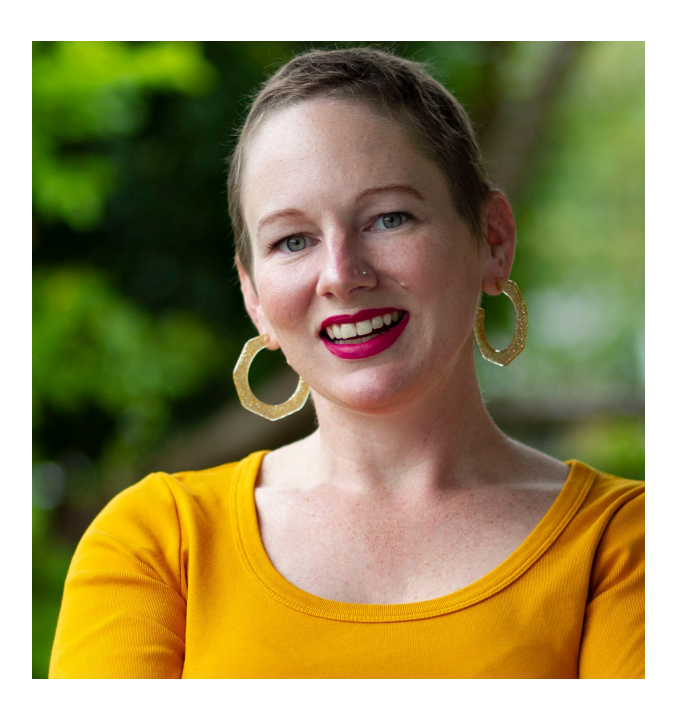
As I Near the End of My Life With Metastatic Cancer, I'm ...